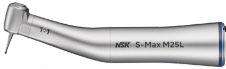
1:1 Direct Drive

OPTIC MODEL: M25L ORDER CODE: C1024 NON-OPTIC MODEL: M25 ORDER CODE: C1027